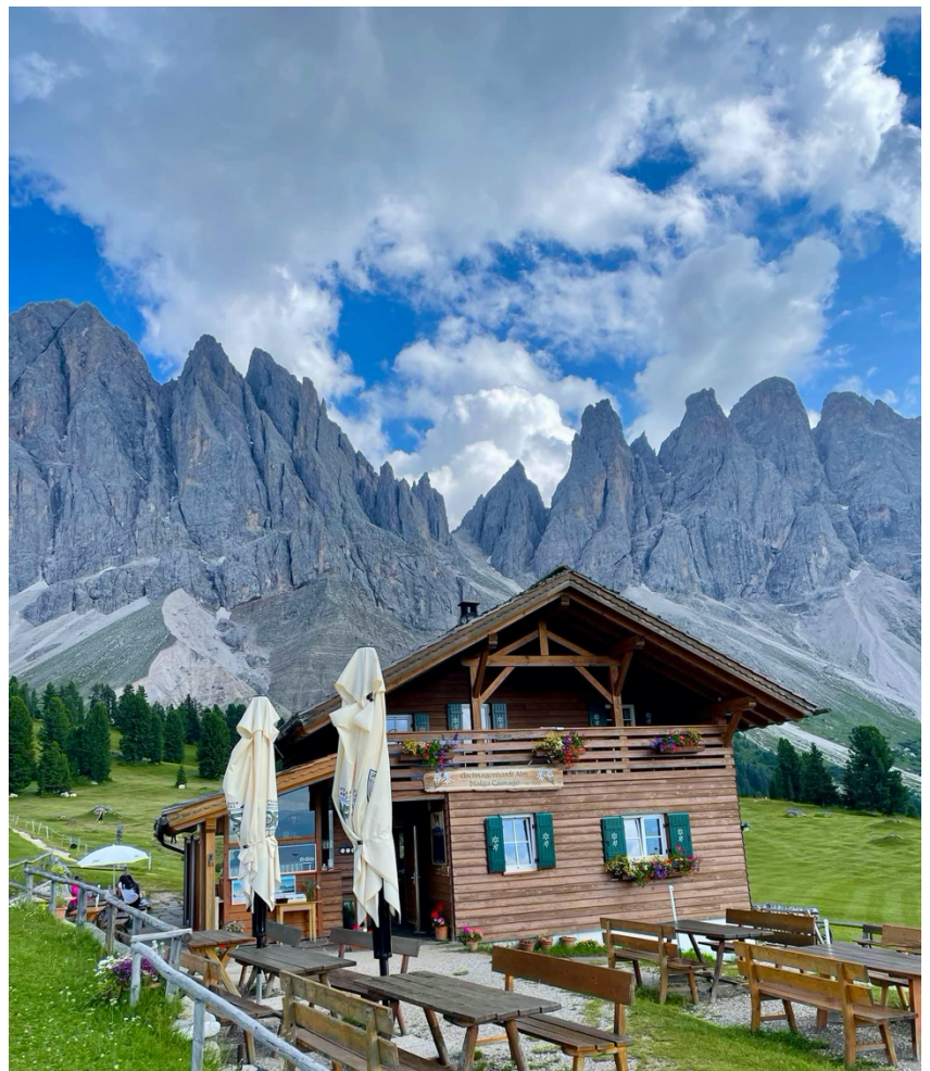
A small Refugio nestled at the base of the Dolomites

As you traverse scenic trails, each day brings new opportunities to immerse yourself in the beauty of the Dolomites, whether you're hiking beneath the majestic Croda Rossa or marveling at the iconic Cinque Torri. These hikes aren't just a feast for the eyes – they're paired with some of the finest culinary experiences in the region. From authentic mountain rifugios serving traditional Ladin delicacies to Michelin-star gourmet restaurants offering creative, refined dishes, this trip is as much about